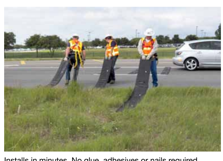
Installs in minutes. No glue, adhesives or nails required. No tools or equipment needed.

Watch the YouTube RoadQuake 2 Assembly Video.