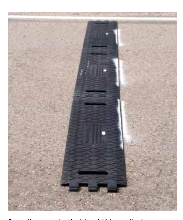
3 sections make 1 strip, 11' long, that traverses an entire lane.