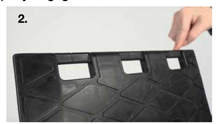
...must engage the rod on the slotted end, shown in Picture 2.