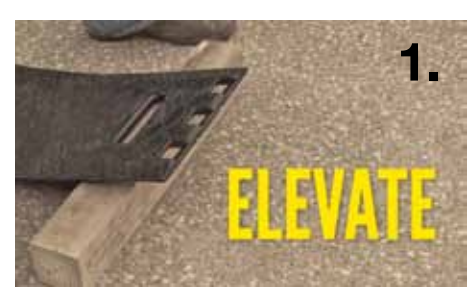
Put the 4x4 under the slotted end of the first section.