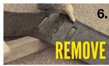
REMOVE the wood and...