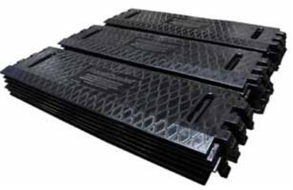
RoadQuake 2 is easy to transport and store.

Features beveled edges on both sides for easy installation.