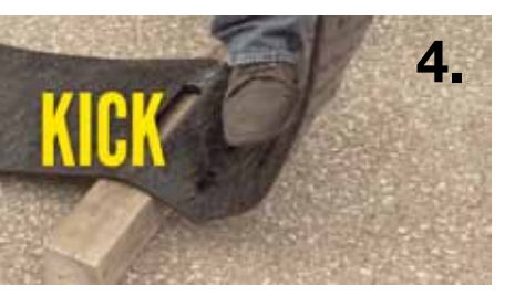
KICK the section in your hand to fully engage the channel on the rod.