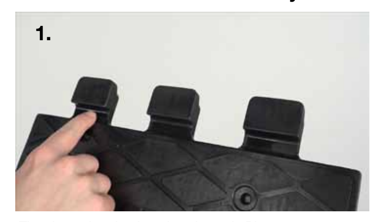
The channel under the tabs, shown in Picture 1...