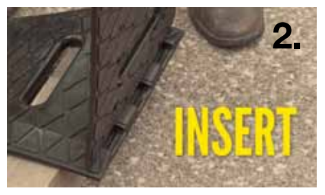
INSERT the tabbed end into the elevated slotted section.

Straddle or stand next to the elevated section.