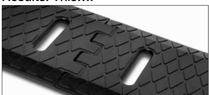
Properly assembled sections should be smooth and flat, as shown in the picture above.